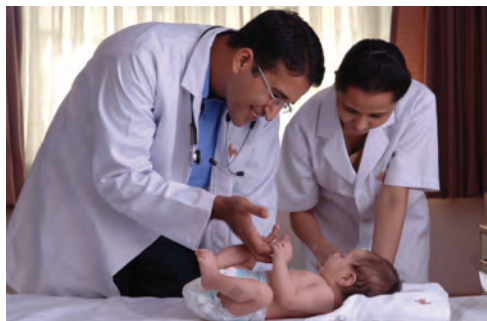
Most babies do not get basic healthcare

The problem does not end with Infant Mortality Rate. The last column of table 1.4 shows around half of the children aged 14-15 in Bihar are not attending school beyond Class 8. This means that if you went to school in Bihar nearly half of your elementary class would be missing. Those who could have been in school are not there! If this had happened to you, you would not be able to read what you are reading now.