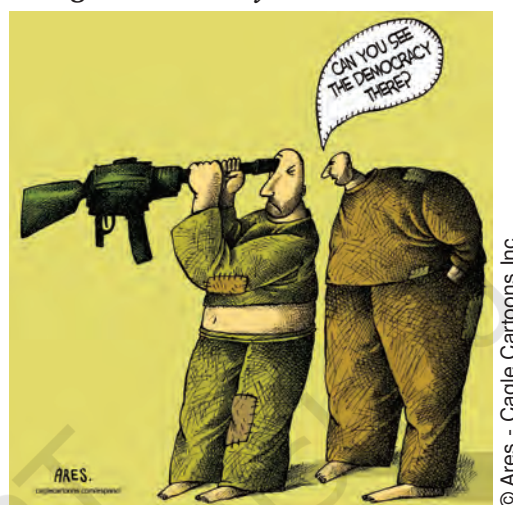
Seeing the democracy