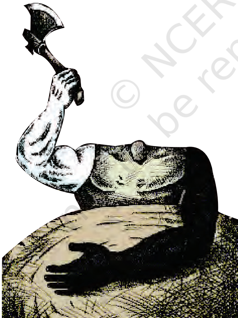
© Ares - Cagle Cartoons Inc.

It is fairly common for people belonging to the same religion to feel that they do not belong to the same community, because their caste or sect is very different. It is also possible for people from different religions to have the same caste and feel close to each other. Rich and poor persons from the same family often do not keep close relations with each other for they feel they are very different. Thus, we all have more than one identity and can belong to more than one social group. We have different identities in different contexts.