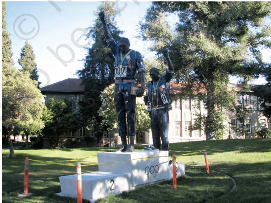
In 2005, the San Jose State University installed a 20-foot high sculpture representing the protest by Tommie Smith and John Carlos. A photograph of the original medal ceremony in 1968 is on the top.

Do you think that Carlos and Smith should have raised an internal matter of American society in an international forum? Would you say that what they did was political? Why do you think Peter Norman, who was neither Black nor American, joined in the gesture of protest? If you were in Norman's place what would you do?