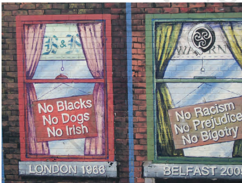
In some societies of Northern Ireland, the colonies of Protestant and Catholic communities are divided by walls. These walls are sometimes filled with graffiti as you can see here. The Irish Republican Army and British Government signed an agreement in 2005. What does the graffiti here tell about the conflict in the society?

Second, it depends on how political leaders raise the demands of any community. It is easier to accommodate demands that are within the constitutional framework and are not at the cost of another community.