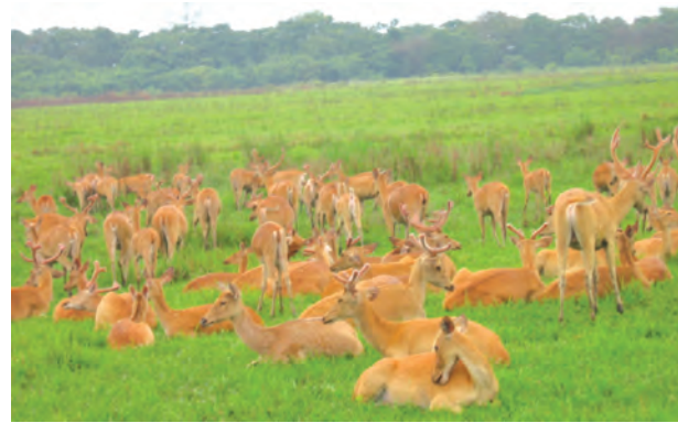
Fig. 2.4: Rhino and deer in Kaziranga National Park

dwindled to 1,827 from an estimated 55,000 at the turn of the century. The major threats to tiger population are numerous, such as poaching for trade, shrinking habitat, depletion of prey base species, growing human population, etc. The trade of tiger skins and the use of their bones in traditional medicines, especially in the Asian countries left the tiger population on the verge of extinction. Since India and Nepal provide habitat to about two-thirds of the surviving tiger population in the world, these two nations became prime targets for poaching and illegal trading.