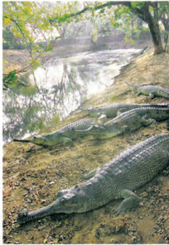
CRITICALLY ENDANGERED: Captive gharial at the Madras C

W ISPY tendrils of mist rise delicately from the water surface, tinged gold by the dawn. Your breath hangs as little clouds of vapour as you gaze upon the Girwa River on a cold winter morning. A trio of hollow clapping sounds from the other side of the river, half a kilometre away tells you that an adult male gharial is advertising his presence. It is the height of the breeding season. The place seems trapped in a time in early history when man was still clad in animal skins. It is only as the sun rises higher and burns the mist off the water that the world comes into focus with appalling clarity. The five-km stretch of the Girwa River in Katerniaghat Wildlife Sanctuary is one of the only three wild breeding sites left in the world for the most unique of all the