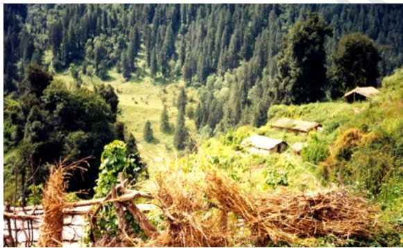
Figure 16.2 A view of a forest life

their teak from a forest farther away. They do not have any stake in ensuring that one particular area should yield an optimal amount of some produce for all generations to come. What do you think will stop the local people in behaving in a similar manner?