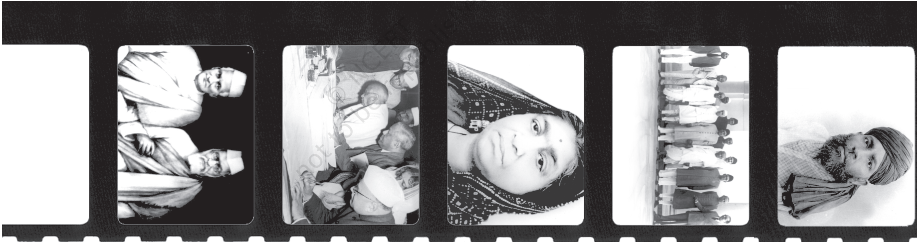
Nehru Memorial Museum and Library, New Delhi