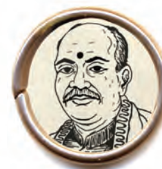
Shyama Prasad Mukherjee

(1891-1956) born: Madhya Pradesh. Chairman of the Drafting Committee. Social revolutionary thinker and agitator against caste divisions and caste based inequalities. Later: Law minister in the first cabinet of post-independence India. Founder of Republican Party of India.