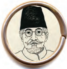
Abul Kalam Azad

(1888-1958) born: Saudi Arabia. Educationist, author and theologian; scholar of Arabic. Congress leader, active in the national movement. Opposed Muslim separatist politics. Later: Education Minister in the first union cabinet.