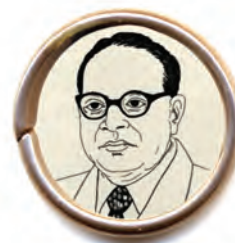
Bhimrao Ramji Ambedkar

(1887-1971) born:Gujarat. Advocate, historian and linguist. Congress leader and Gandhian. Later: Minister in the Union Cabinet. Founder of the Swatantra Party.