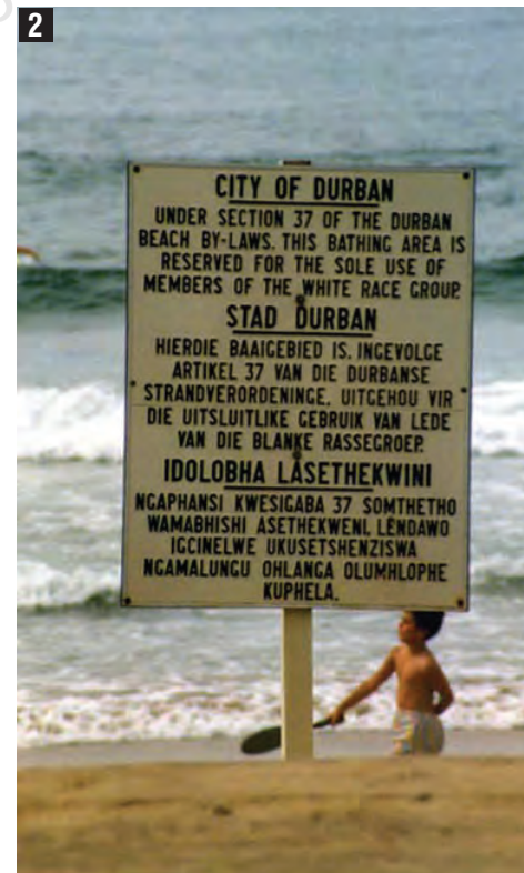
2 Sign on Durban beach in English, Afrikaans and Zulu. In English it reads: ‘CITY OF DURBAN Under section 37 of the Durban beach by-laws, this bathing area is reserved for the sole use of members of the white race group’.