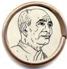
Vallabhbhai Jhaverbhai Patel

(1875-1950) born: Gujarat. Minister of Home, Information and Broadcasting in the Interim Government. Lawyer and leader of Bardoli peasant satyagraha. Played a decisive role in the integration of the Indian princely states. Later: Deputy Prime Minister.