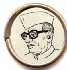
Kanhaiyalal Maniklal Munshi

Constituent Assembly at the stroke of midnight on 15 August 1947: